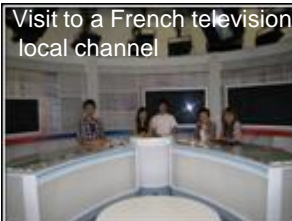
Visit to a French television local channel