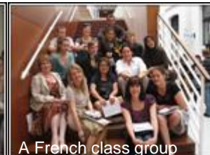
A French class group