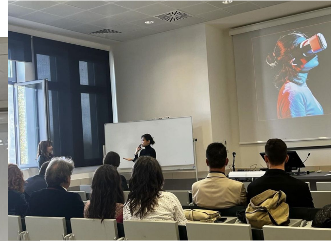
Description: Presentation and defense of my master thesis on the topic of "Design and Implementation of a Virtual Reality Platform for Automotive Architecture Assessment" / The graduation ceremony with other graduates